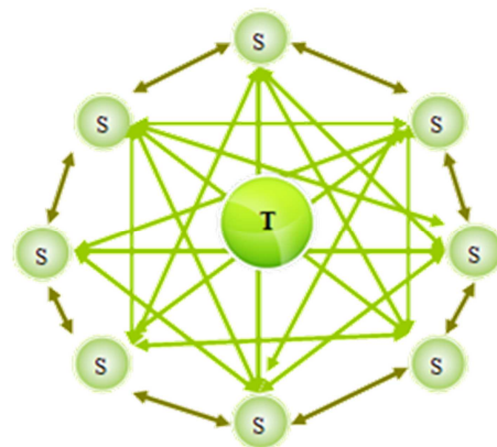
Figure 3. Networked communication in NL (Trentin, 2010).

Along with the development of Internet technology, the first two stages “NL” gradually evolved to match the networked society. The new stage of “Networked Learning” which is featured as the Web3.0, incorporating the distributed structure of the organization, knowledge sharing and the co-production of knowledge through networked collaborative learning. Trentin (2010) described the networked relationship between teachers and students in this approach (see Figure 3). [15]