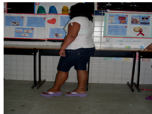
Figure 3. Presentation of the student seminar series on 8th sexual education and sexually transmitted diseases for high school classes and teachers.

This work was conducted in public school located in João Pessoa-PB, in the State School of Primary and Secondary Francisco Campos. We address the issue of Sex Education and its prevention of sexually transmitted diseases, then mentioned that one way to get a good quality sex life, and have information about their partners who are in physical contact. From this conversation with students from 8°-serie-EJA, treat the subject on prostitution and human behavior. In this present study we conducted on these issues, with contextualized lessons and discussions in class, in group's seminars and a workshop room with a view to promoting greater awareness of the issues. Figures 3 and 4 illustrate the seminars on Sexual Education and Sexual Life Quality in workshops presented to the school community.