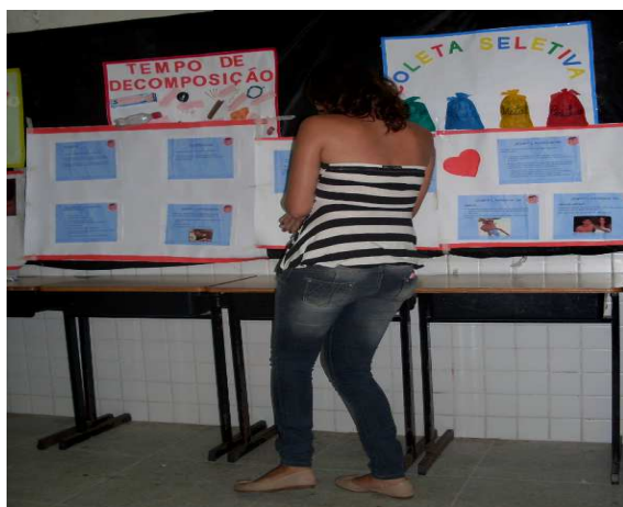
Figure 4. Presentation of the student seminar series on 8th sexually transmitted diseases and prostitution for high school classes and teachers.